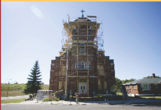
Holy Rosary Today