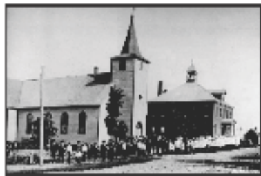
1910—Holy Rosary and school children